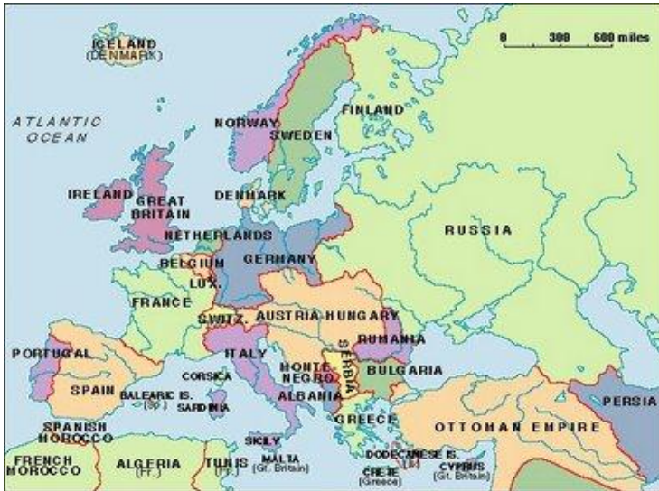
Europe in 1914